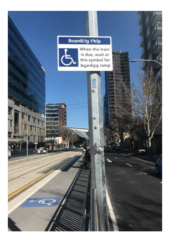
Boarding Help Sign and Access Patch - City South Tram Stop

All train and tram stations have a one (1) metre square blue and white international symbol for access painted on the platform that aligns with the front door of the leading railcar. Boarding help signs are also located in close proximity to the access point, i.e. "Boarding Help – when the tram is due wait at this symbol for boarding ramp." This provides advice to passengers of the location of where boarding devices will be available to access the conveyance.